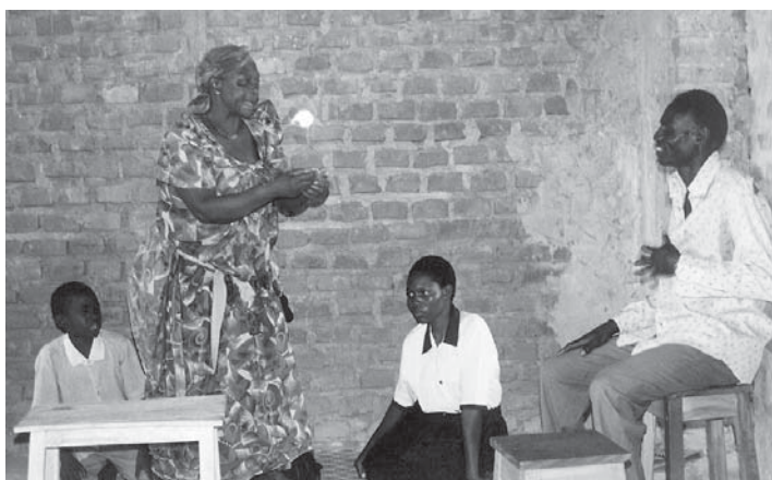
A performance in Namatalan slums addressing issues of rape, domestic violence, and sexual exploitation --- #1892, Uganda Gender Rights Foundation, UGANDA.

VG Update A semi-annual publication of The Virginia Gildersleeve International Fund