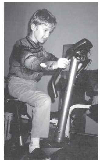
Young boy in physiotherapy session -- #1639, Social Nonprofit Organization Women of Crimea

The beginning stages of this project to provide community-based cassava cultivation, processing, and marketing proved successful. Farm and management skills increased; farmers gained experience in production and application of organic manure and appropriate use of agro-chemicals; and improved cassava varieties produced a bumper crop. The project unexpectedly attracted the attention of a Member of Parliament to the area who promises to ensure continuation of the project into the second year.