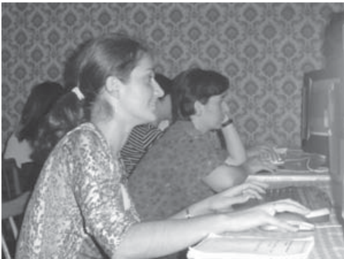
Women learn computer literacy skills in Kvemo Kartli, Georgia.

The interim report for this project describes the establishment of a computer teaching center for women from Georgia, Azerbaijan, and Armenia in Kvemo Kartli.