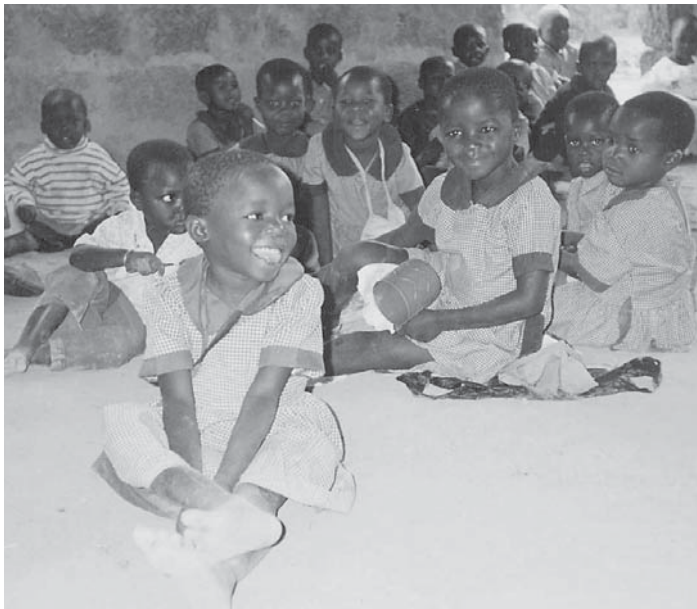
Children with HIV/AIDS in Kenya are given nutritious food and provided with an education while their families participate in a program of voluntary communal labor --- #1748, Gitaru Marigu Development Group.

Remember the challenge our president issued to increase membership by each of us being responsible for adding a new member to the Fund. There are 1,376 individual and 172 group members representing 45 countries in VGIF at this time.