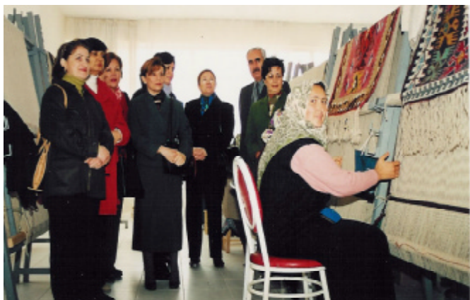
#1472 The Turkish Association of University Women - demonstrating the Kilim Rug Weaving Course

This project will fund a three-day residential seminar covering capacity building in human and financial resources, project development and networking needs of women and girls in developing countries.